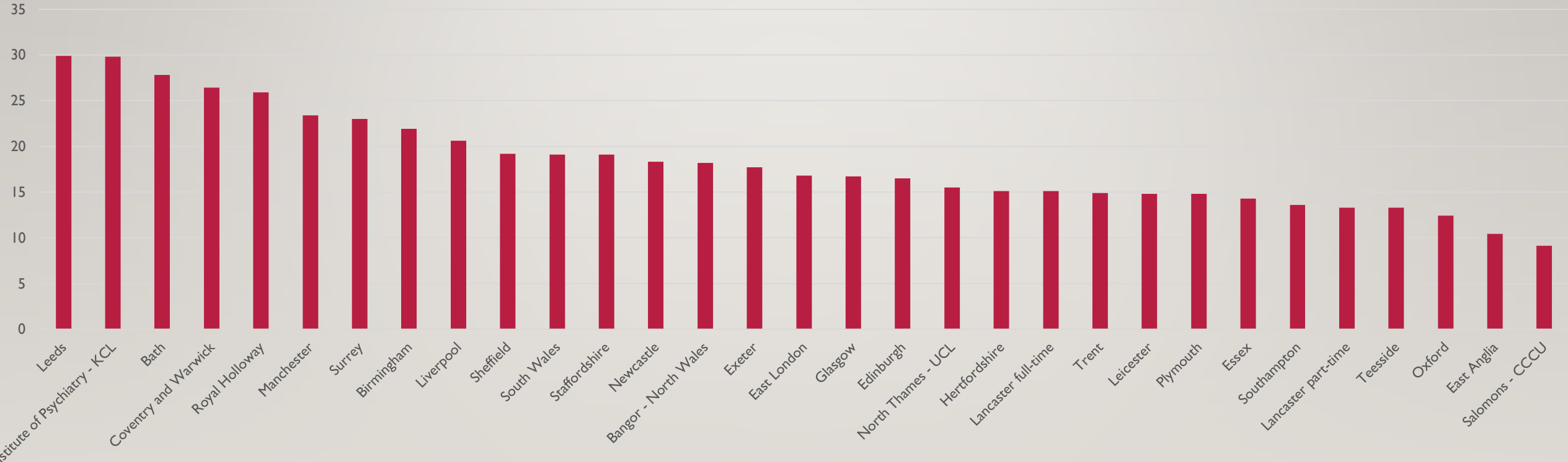
Applications per place